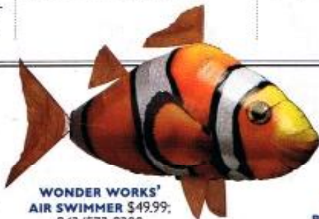
WONDER WORKS' AIR SWIMMER $49.99; 843/573-9300

Some guaranteed big hits. Call and order a few "Hot Toys" for the children on your list. (We did.)