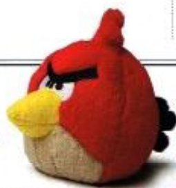
THE OWL'S NEST'S ANGRY BIRD PLUSH TOY $15.99 and up; 817/251-0155