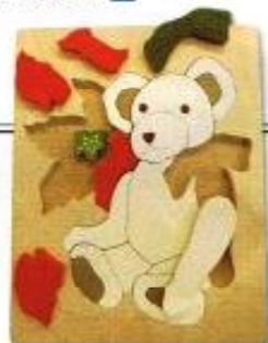
ROOTIN' RIDGE'S HOLIDAY PUZZLE $25; 512/453-2604